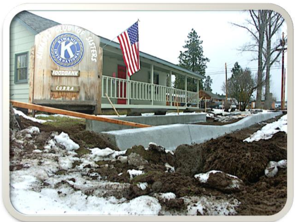
Oak St. And E. Main Ave. undergo improvements to the curbs and bump outs. Parking in front of our Kiwanis House will become “back in” slots to enhance traffic safety