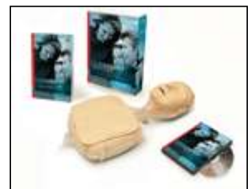
Pictured -- a CPR Anytime

and share learning with their families. The overall goal of this effort is to increase the number of Sisters area residents capable of providing life-saving support to a person in need.