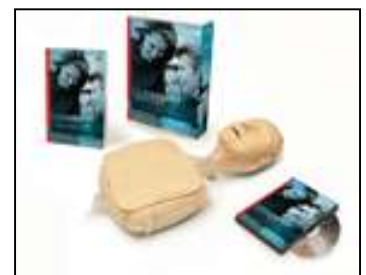
Pictured -- a CPR Anytime

and share learning with their families. The overall goal of this effort is to increase the number of Sisters area residents capable of providing life-saving support to a person in need.