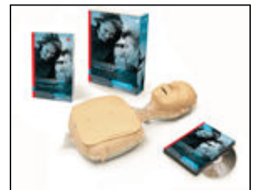
Pictured -- a CPR Anytime

and share learning with their families. The overall goal of this effort is to increase the number of Sisters area residents capable of providing life-saving support to a person in need.