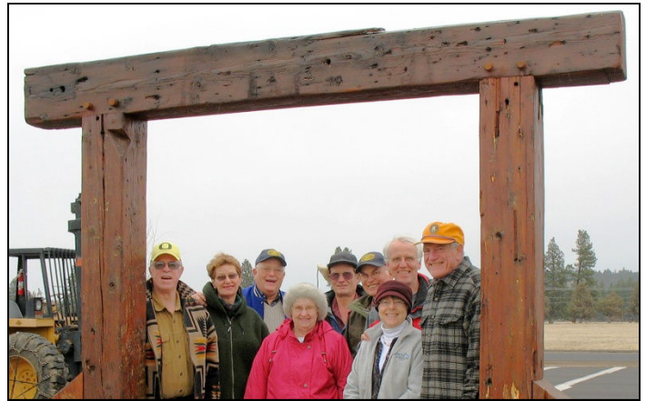
Smiling Sisters Kiwanis members celebrate under the new entrance.

The reality is finally setting in. Cliff Clemens Park is coming to fruition. After years of working with the City, listening to residents input, club members were finally able to act on a way forward. Next up is getting a fence installed -- hope you can help!