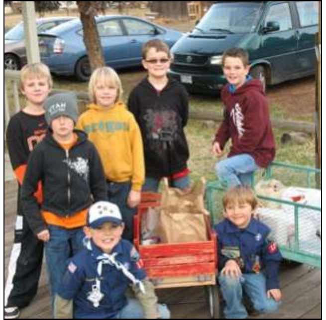
Cub Scouts delivered food to the Sisters Kiwanis Food Bank.

The school's leadership class made a special food delivery to FAN on Friday.