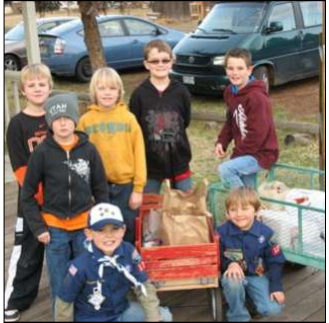
Cub Scouts delivered food to the Sisters Kiwanis Food Bank.

The school's leadership class made a special food delivery to FAN on Friday.