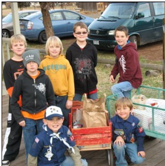
Cub Scouts delivered food to the Sisters Kiwanis Food Bank.

The school's leadership class made a special food delivery to FAN on Friday.