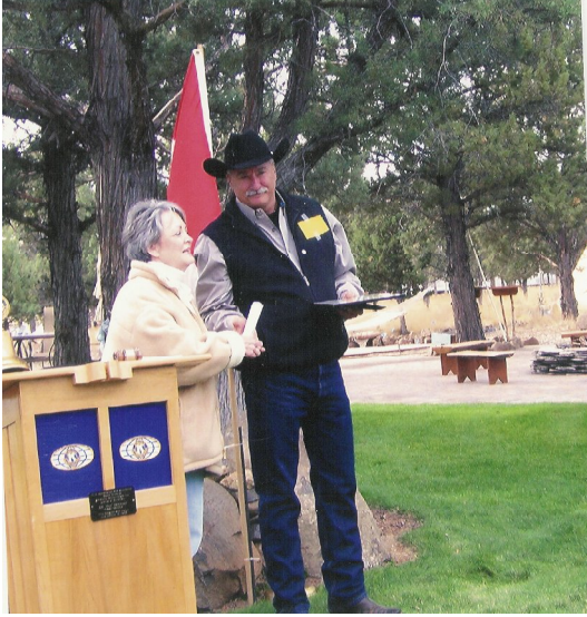
The gavel is passed